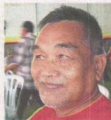
Md Derus suspects the rubbish problem is due to illegal private waste contractors.

bish in plastic bags and toss them out of moving vehicles are one of them while the other suspects are illegal private waste contractors.