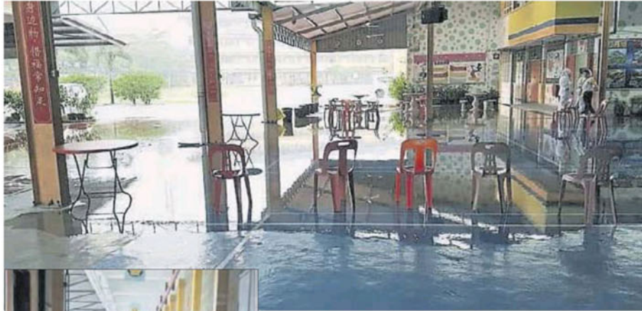
← ↑ 公民華小逢雨必浸情形。