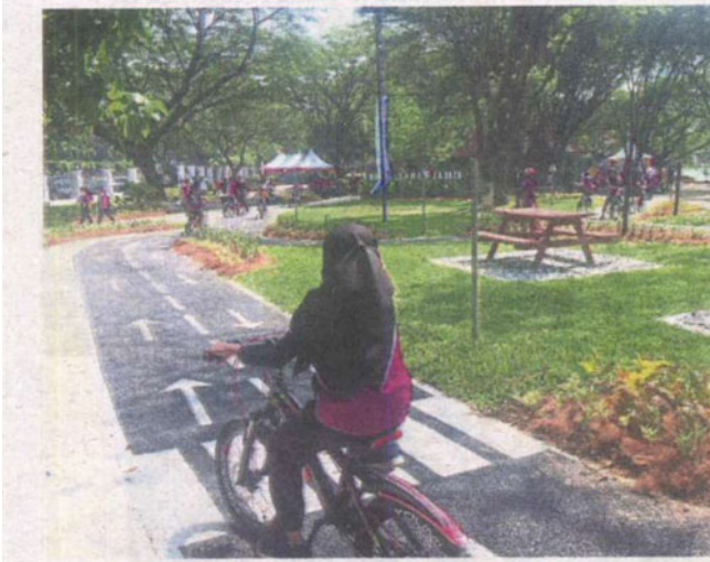
Children can now enjoy cycling on the new bicycle track as their parents keep an eye on them from the many benches placed in the park.

The newly added facilities are expected to encourage more residents to embrace a green and healthy lifestyle.