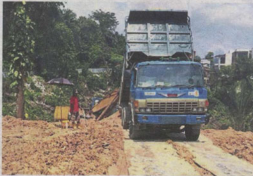
Taman Ukay Heights residents were alarmed when they saw lorries dumping earth and rubble into the ravine along Jalan Teberau.

"But for the past month, we noticed relays of 20-tonne lorries dumping soil into the lot which is a ravine with steep slopes which has a gradient of more than 45 degrees. "We estimate that 60,000 tonnes