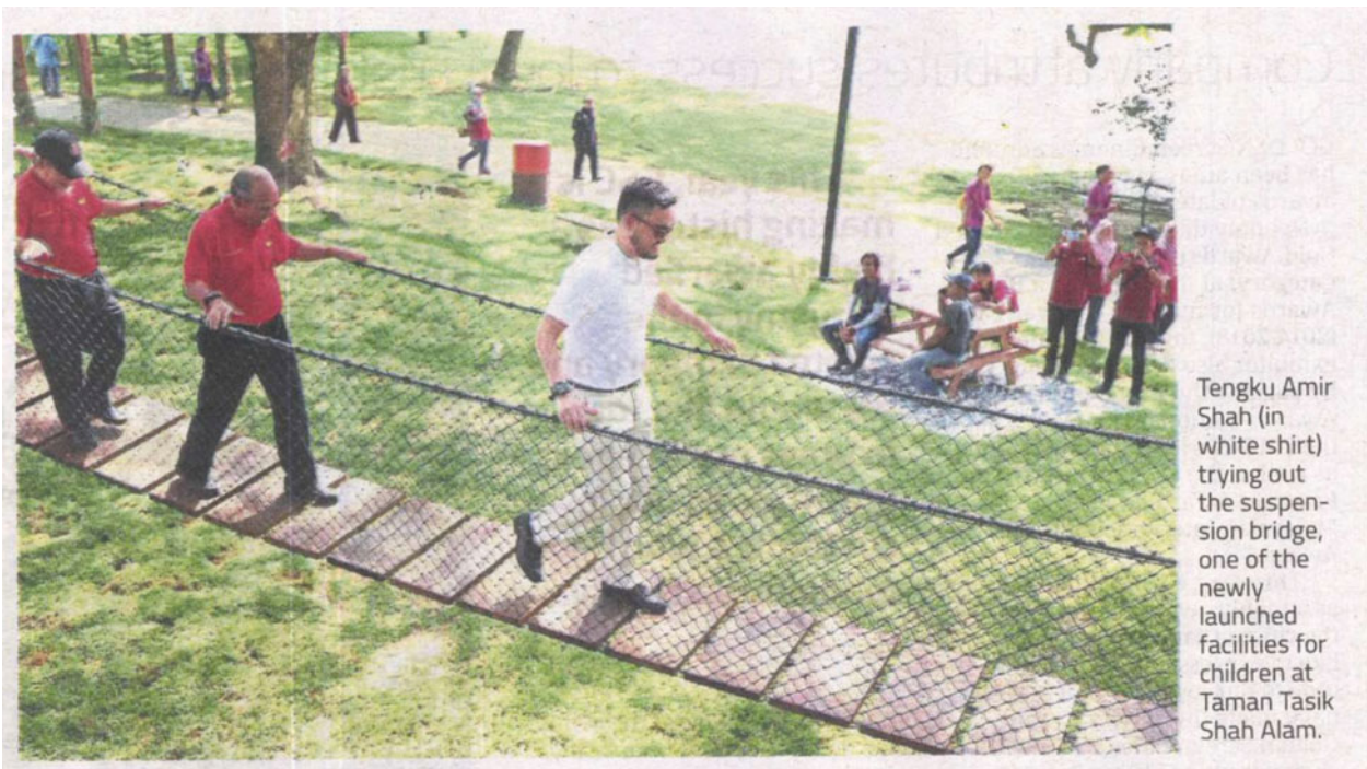
Tengku Amir Shah (in white shirt) trying out the suspension bridge, one of the newly launched facilities for children at Taman Tasik Shah Alam.