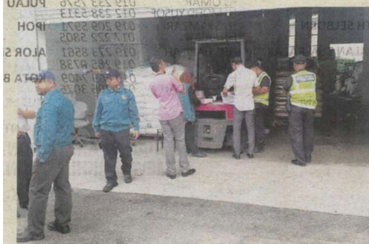
PENGUAT KUASA JAS Selangor dan MPK membuat pemeriksaan ke atas sebuah premis memproses plastik kitar semula di Kawasan Perindustrian Air Hitam, Klang semalam.