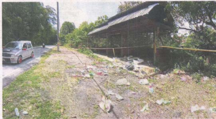
An abandoned kiosk becomes a dumping ground along a road in Kampung Sungai Merab Hulu.