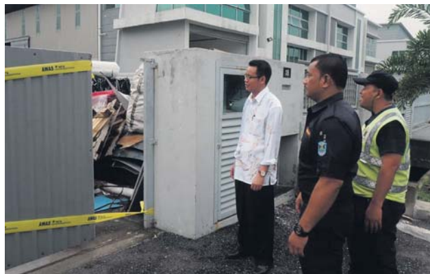
Proses sitaan sedang dilakukan oleh pihak penguatkuasa.

Menurut beliau, pihaknya turut mengeluarkan enam notis di bawah Undang-Undang Kecil Pelese-