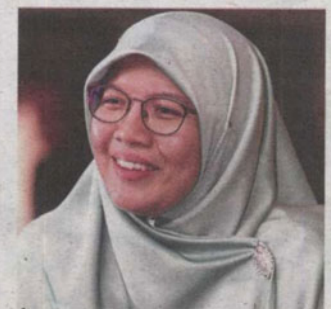
Anfaal says the council will consider public opinion for future projects.

hoped to encourage senior citizens to use the public areas as there would be exercise equipment and park benches for their benefit.