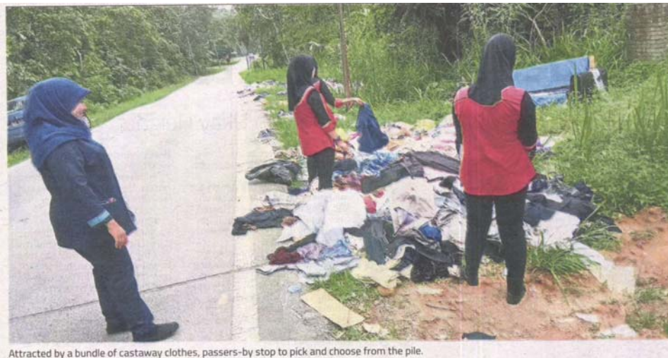
Attracted by a bundle of castaway clothes, passers-by stop to pick and choose from the pile.